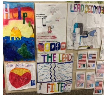
Gr 5 Water Pollution Research Project