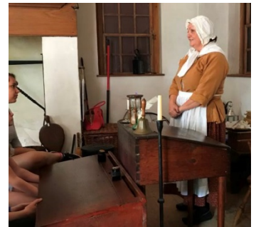
HMS Students Visit Historic Mt Holly

And more, I want to celebrate the emphasis on One District, One Community. Examples include our Positive Behavior Systems, amazing PTA/O District Events like the Color Run, incorporating Service Learning Community Projects, College and Career Days, our Special Services Improvement Plan, and our district PK-Gr 8 Mathematics Achievement Plan.