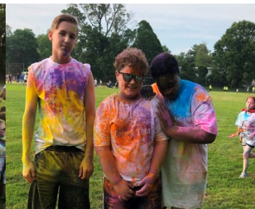
Color Run Fun!