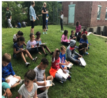
Gr 2 Explores Animal & Plant Habitats in Mt Holly

Just as important is the real world experiential learning I am noticing. Learning is living and breathing inside and outside of the walls of the school.